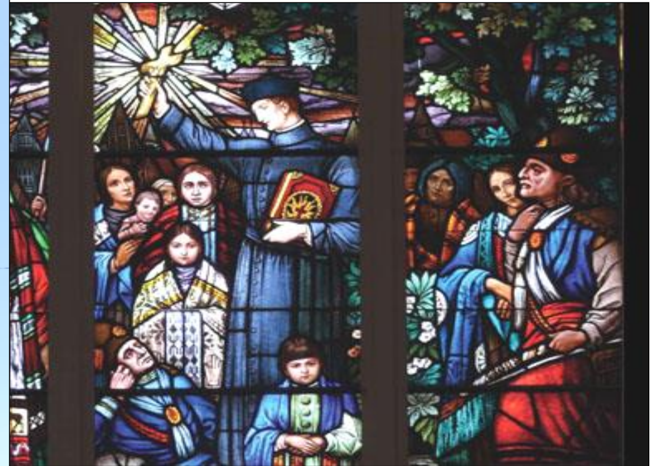
"The Osage Window" at Immaculate Conception Catholic Church